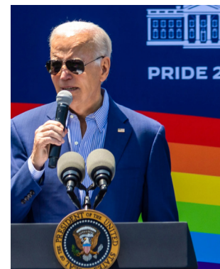
President Joe Biden

It is no surprise that the bullying and discrimination that transgender Americans face is worsening our Nation's men-