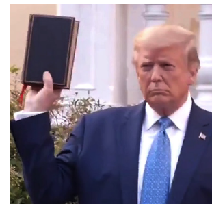
Donald Trump

On Easter Sunday we proclaim with joy that Christ has risen. Both of these sacred celebrations remind us of how God's love redeems the world. Almost 3,000 years ago, the prophet Isaiah wrote: “Darkness covers the earth, but the Lord rises