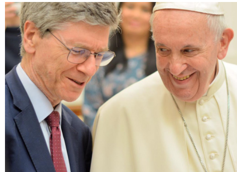
One of the Pope's many meetings with Jeffrey Sachs (L), the architect of the UN's controversial 'Sustainable Development Goals'

The article also noted, "Though he is not Catholic, Sachs has maintained strong ties with the Vatican for decades, advising Holy See officials on economic matters for Pope John Paul II [especially in 1991] before he issued the social encyclical 'Centesimus annus' (Hundredth Year). Sachs is often seen in