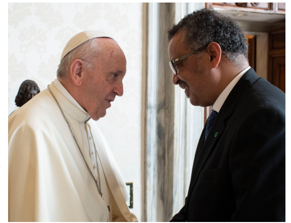
The Pope in talks with Tedros, boss of the World Health Organisation

He continued, "The Sustainable Development Goals include unhindered access to birth control and abortion. Google and the UN have negotiated an agreement to censor dissent; Google use algorithms to promote news and