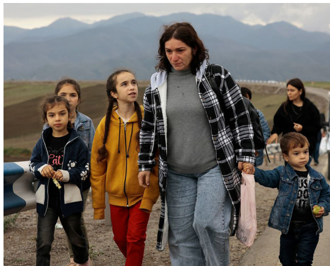
Armenians fleeing from Azeri invaders