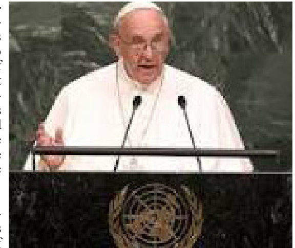
The Pope lectures the United Nations – about climate change