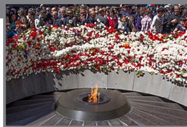
The Armenia National Genocide Memorial

genocide which is now formally recognised by 42 countries, including Wales and Scotland. To its shame, the UK government adamantly refuses to do so, claiming that “the evidence is not clear enough”. Armenia is now reduced to a country of under 3 million people, nearly surrounded by three hostile Muslim states: Tur-