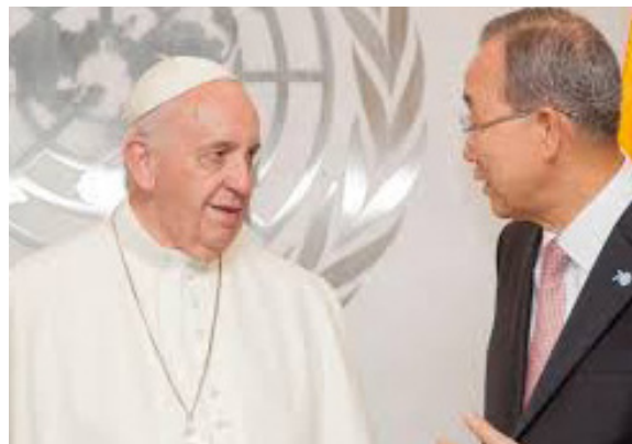
The Pope meets Ban Ki-moon at the UN

At COP 20, in Cancun, Mexico, in 2014, later that year, the UN Head of Climate Change prayed to the 'Mind God', the "god of tapestries and creativity", who would later inspire COP 28 to "devise a tapestry of creative solutions to climate change." It was one of many examples of open paganism at the COP get-togethers.